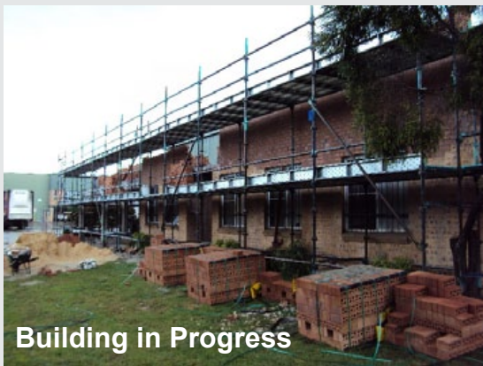
Building in Progress